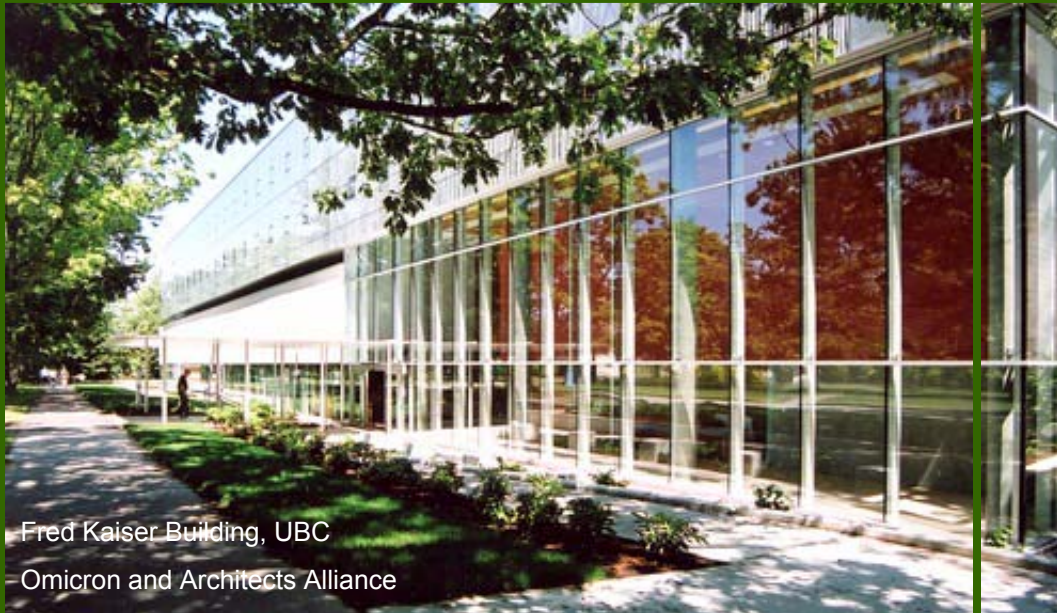
Fred Kaiser Building, UBC Omicron and Architects Alliance