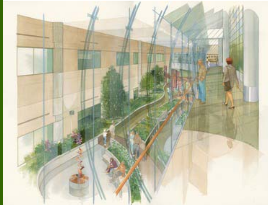
Mazankowski Alberta Heart Institute, Edmonton, AB