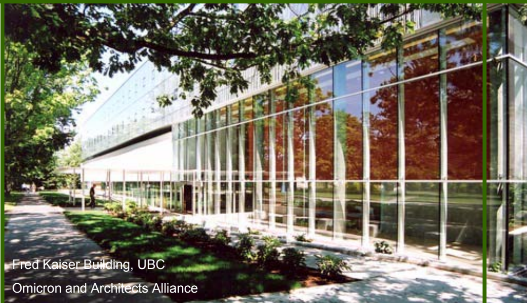
Fred Kaiser Building, UBC Omicron and Architects Alliance