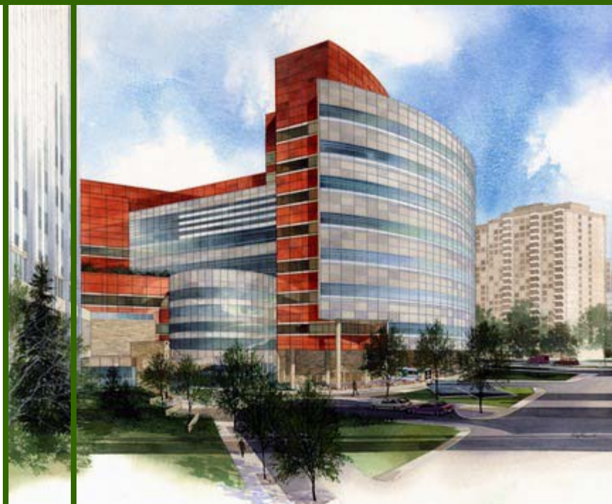
Mazankowski Alberta Heart Institute, Edmonton, AB