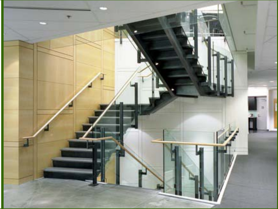
Stantec Vancouver Office