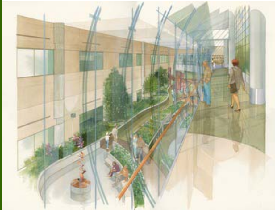
Mazankowski Alberta Heart Institute, Edmonton, AB