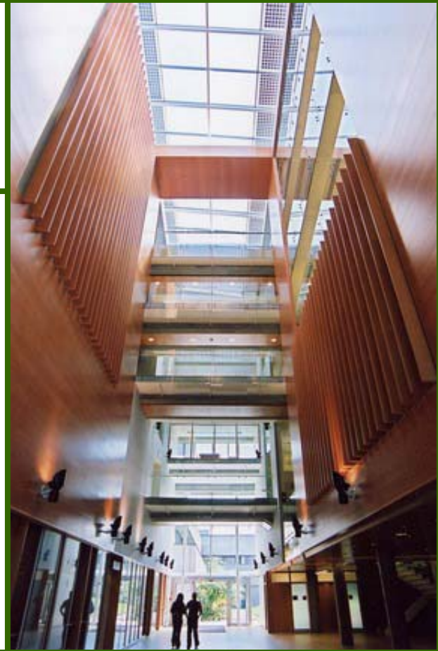
Fred Kaiser Building, UBC Omicron and Architects Alliance