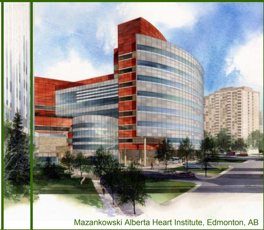
Mazankowski Alberta Heart Institute, Edmonton, AB